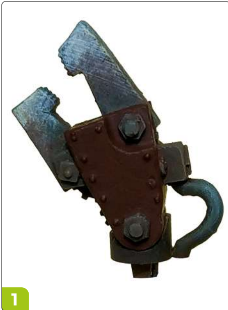
1. Basecoat with Redwood Brown.

Another Step by Step using the Greenstuff World paints to test the main colors: a very worn yellow plate.