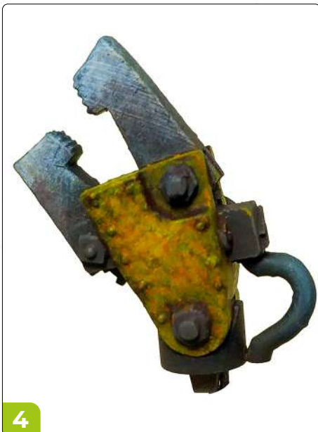
4. Next highlight is made using only Cyber Yellow.