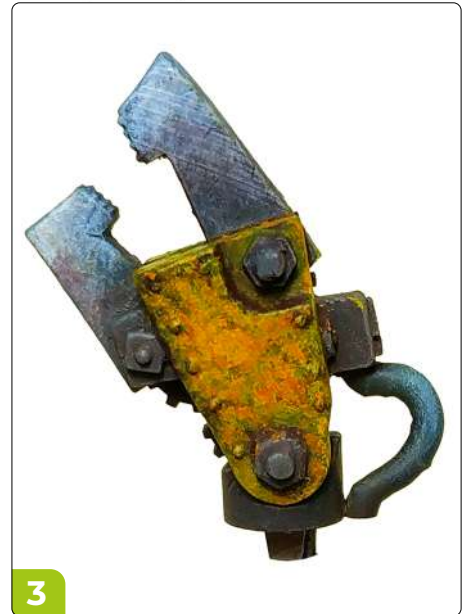
3. Second highlight stippling with a 50 % mix of Flaming Orange and Cyber Yellow.