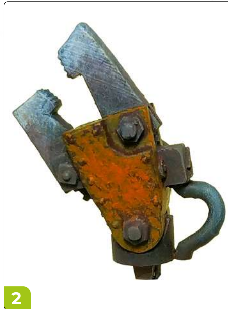
2. First highlight stippling with Flaming Orange.