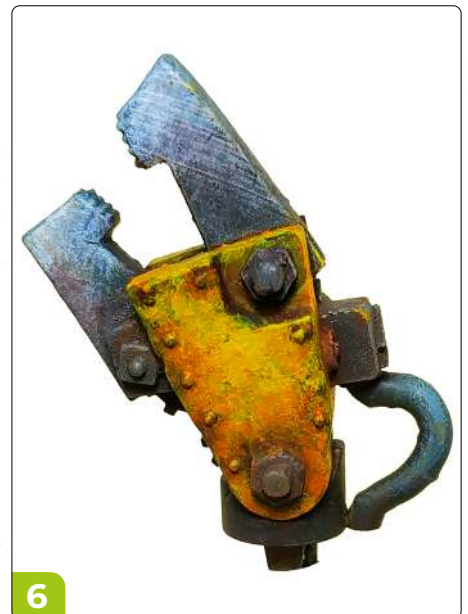
6. Give general glazes with diluted (60% water) Red Truth to add the shadows.