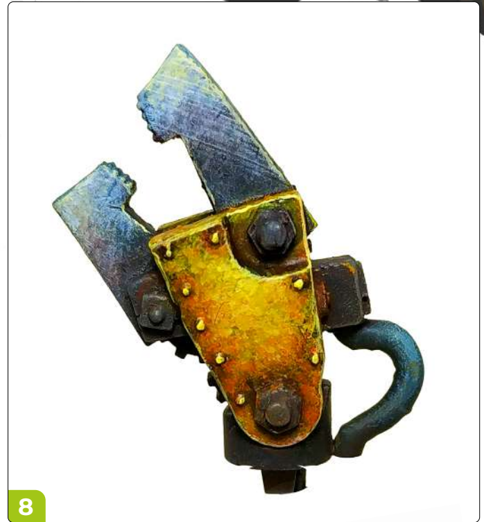
8. Finally, give a general wash with 50% diluted Hydromiel Yellow Ink to get an extra yellowish tone.