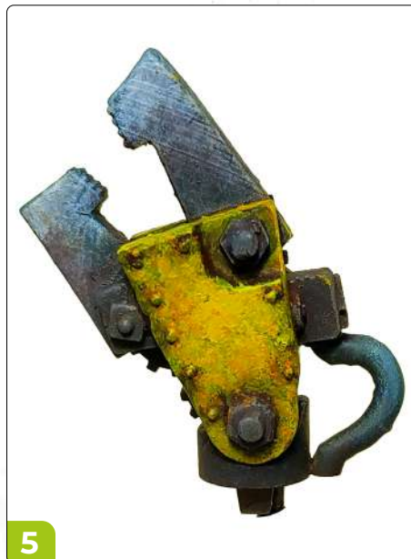
5. I made the final highlight stippling with a 50 % mix of Banana Split and Cyber Yellow.