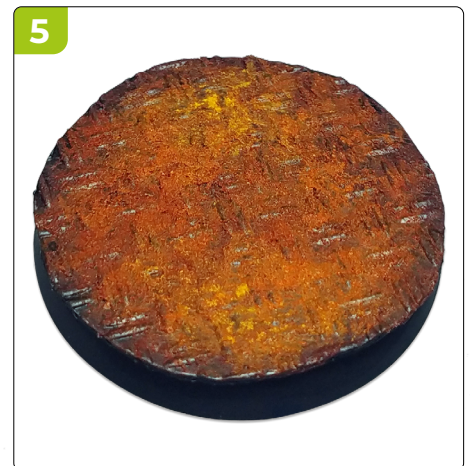
5. Small and dispersed stains of Light Oxide Rust.