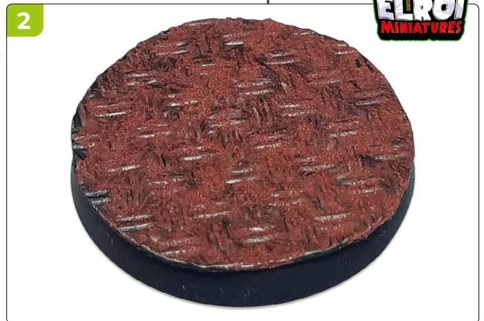
2. Capa de Dark Oxide Rust.