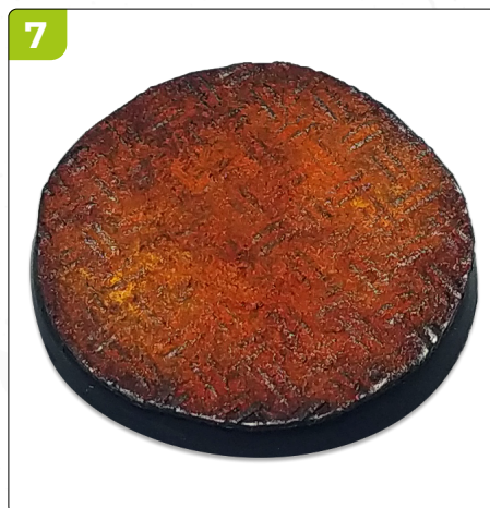
7. Aplicar pincel seco muy suave con negro mate en toda la peana.