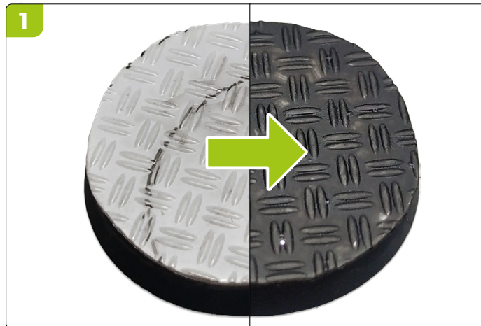
1. Base de Plasticard texturizado, imprimada en negro mate.