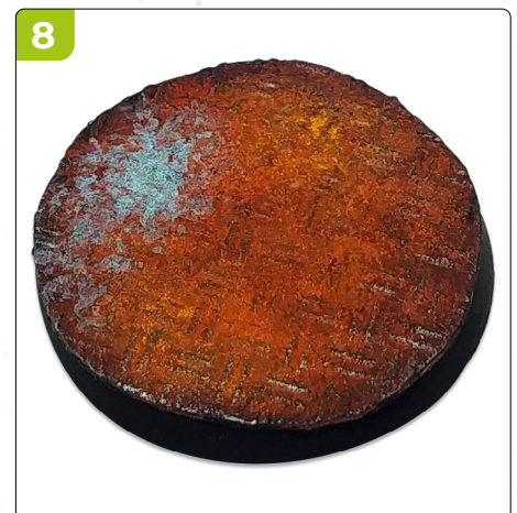
8. Add small stains with Verdigris Rust to create some color contrast.