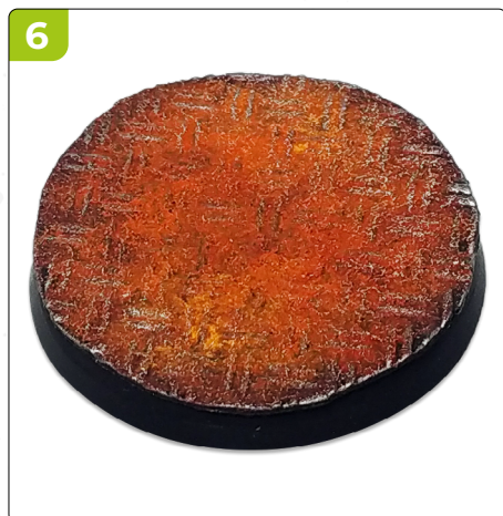
6. Aplicar pincel seco con Gunmetal Grey en las zonas más externas.