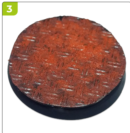
3. Capa de Red Oxide Rust, ligeramente diluida.