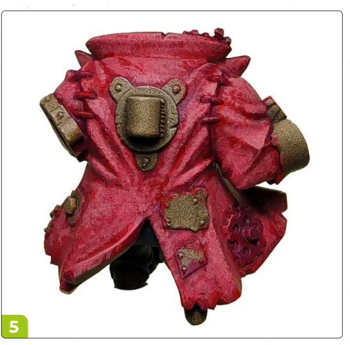
Third highlight stippling with a 50/50 mix of Red Truth and Golden Cream.