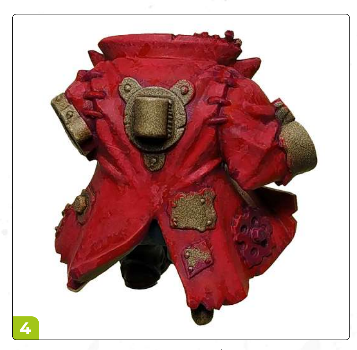
Second highlight stippling with a 80/20 mix of Red Truth and 5. Golden Cream.