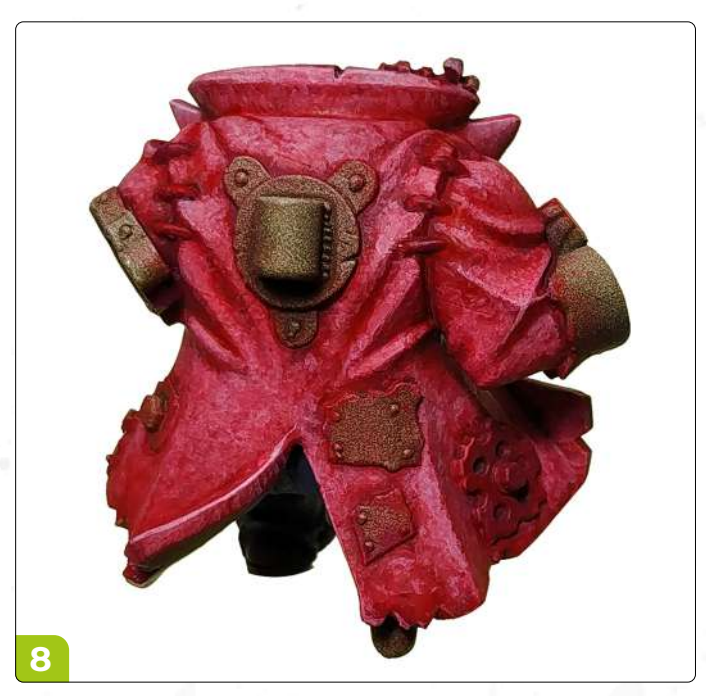
Apply 2-3 general washes with highly diluted (70% water) Red Truth to the whole piece to recover the reddish tone and smooth the texture.