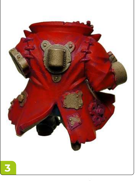
First highlight stippling with Red Truth, covering most of the area.