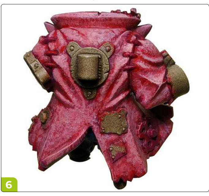
6. Keep highlighting with a 20/80 mix of Red Truth and Golden Cream.