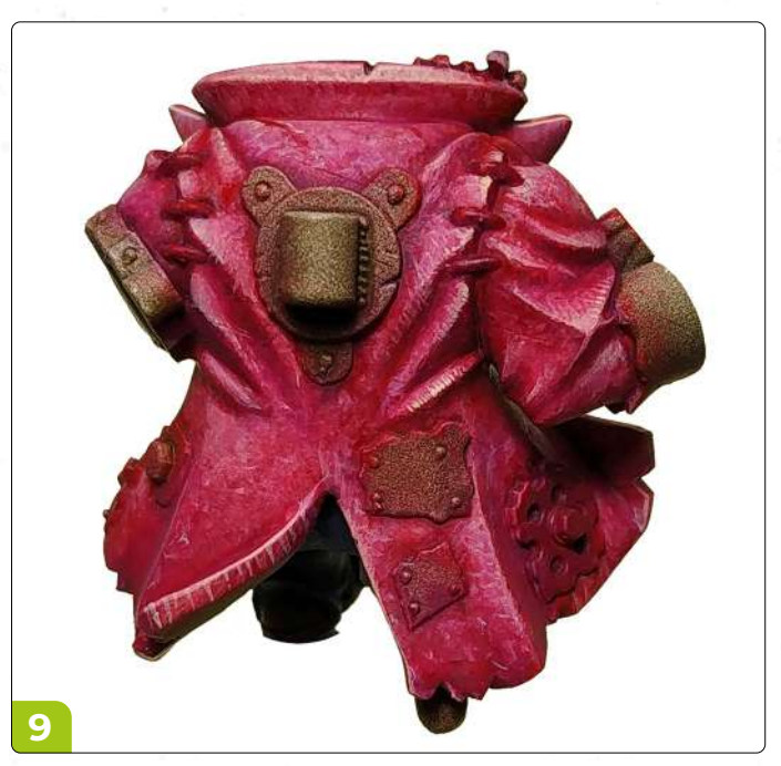
9. Using a 90/10 mix of Banana Split and Red Truth, outline the edges of the surfaces and add some fine texture lines and spots.