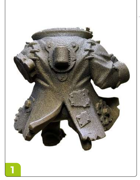
Undercoated and preshaded model with 2. Basecoat with Sangria Red. spray (as seen on a previous SBS).

Another Step by Step using the Greenstuff World paints to test the main colors: a brigth red texturized coat.