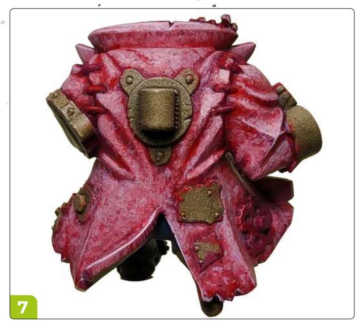
Add a bit of Fang White to the 1.6 step mix to give the final highlight.