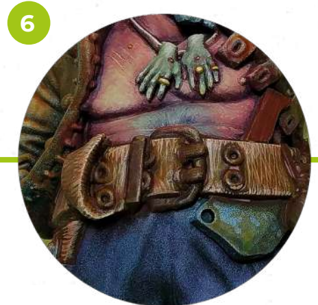
6. General shadows and tones with a couple of washes with the Pecatum Flesh Ink. This step also gives some smooth to the textures.