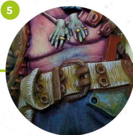
5. Third highlight, this time making shorter texture lines with Ivory Tusk.