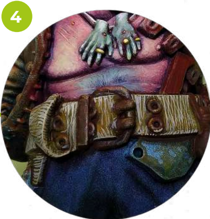
4. Second highlight making a lot of vertical texture lines with Sun Bleached Bone.