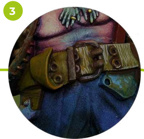
3. First highlight with Leather Brown, covering most of the area (in the picture, left area of the belt only!).