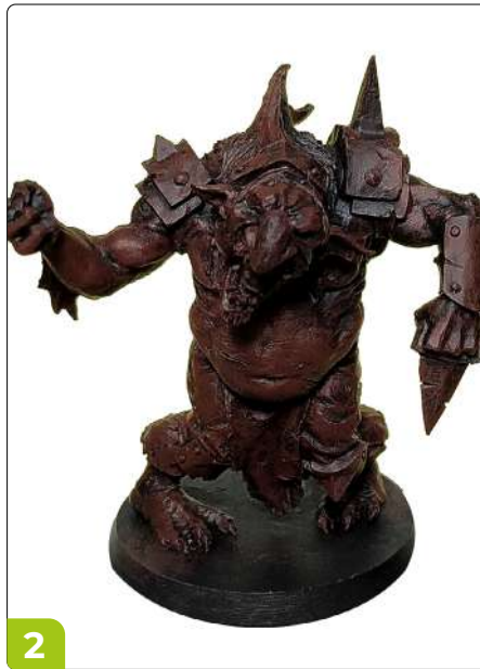
2. First highlight using an energetic drybrush with Choco Brown.