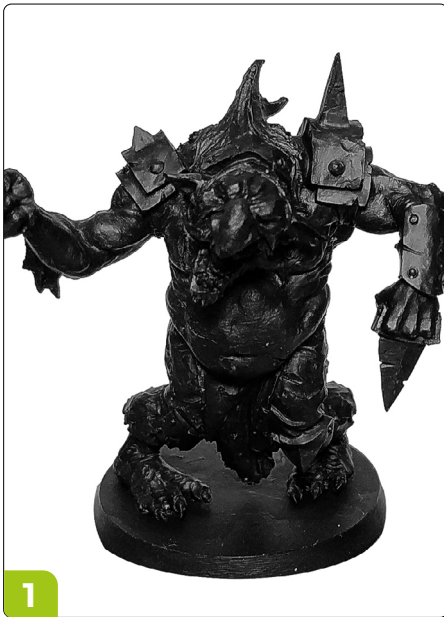
1. Priming with Matt Black.

Another Step by Step using the @greenstuffworld paints: this time the color tested is green on this gorgeous Blood Bowl troll from @massivedragonminiatures.