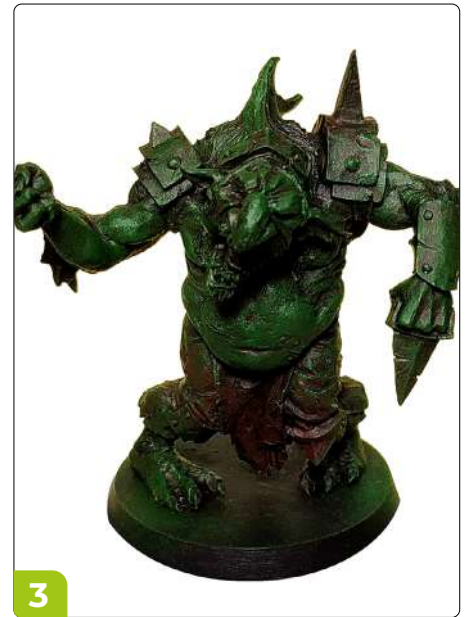
3. Second highlight with a 50% mix of Forest Green and Choco Brown, also with heavy drybrushing.