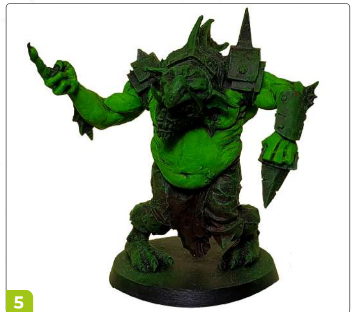
5. Here is the first step of different highlights, blending with a 80/20% mix of Hunter Green and Flubber Green.